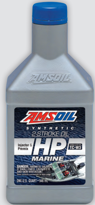
NMMA TC-W3 API TC

HP Marine is formulated with MAXDOSE™, a system of advanced additives for "super-clean" operation. It helps prevent deposits that lead to poor performance. In field testing, HP Marine inhibited ring deposits that can cause ring sticking and ring jacking (carbon build-up behind the ring, forcing it outward), a phenomenon that occurs in modern DFI outboard motors. It also virtually eliminated exhaust port deposits for reliable, efficient operation.