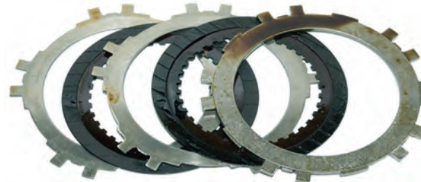
Automatic transmission clutch plates after cleanup with AMSOIL Engine and Transmission Flush reveal lighter glazing and varnish.