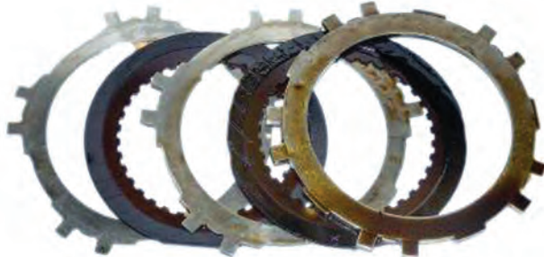
Automatic transmission clutch plates pre-cleanup. Varnish and glazing is heavy on some of the plates.