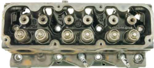
Cylinder head after cleanup with AMSOIL Engine and Transmission Flush. The valve springs and push rod openings are noticeably cleaner, with fewer sludge deposits. The manufacturer's stamping is more easily seen.