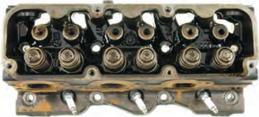
Cylinder head pre-cleanup. Note the sludge deposits on and around the valve springs and push rod openings.