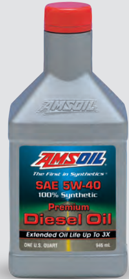
AMSOIL SAE 5W-40 Fuel Economy Results – FTP Cycle

AMSOIL, the leader in automotive synthetic lubrication, produced the world's first API-qualified synthetic motor oil in 1972. Trust the extensive experience of AMSOIL, The First in Synthetics®, to do the best job protecting your engine.