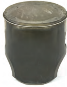
PISTON 1 Exhaust Side