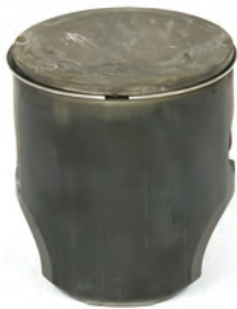
PISTON 1 Intake Side

AMSOIL disassembled the Rotax® motor from Scheuring Speed Sports' Ski-Doo® race snowmobile ridden by Robbie Malinoski during the 2010/2011 professional snocross tour. Both pistons revealed minimal wear and were suitable for continued use. AMSOIL DOMINATOR delivered outstanding protection for Malinoski's Ski-Doo in the most severe environment.