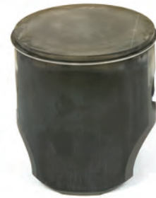
PISTON 2 Exhaust Side