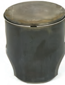
PISTON 2 Intake Side