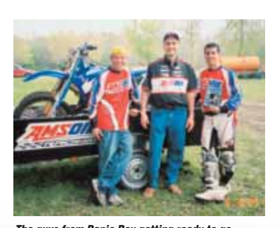
The guys from Panic Rev getting ready to go.

cants. No other products have been used in this sled," said Leirmoe. "AMSOIL products not only proved their durability, they also helped me boost performance, increase the reliability and provide better protection for the components of our sled, just by the choice of lubricants."