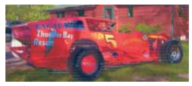
Jerry Grasse shows off his winning modified racecar.

The engine temperature shot up to 290°, and Grasse credits AMSOIL with allowing him to finish the race.