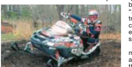
Kristen Leirmoe on her wood chip practice track.

grease, shock oil and engine oil, all AMSOIL," said Leirmoe. "After every race I would check over the entire sled and never found any component damaged due to a lubrication problem."