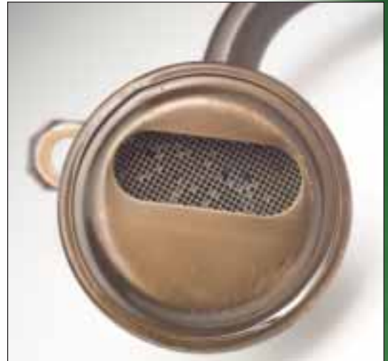
The oil pickup tube was very clean. There were minimal carbon deposits in the pickup tube screen..