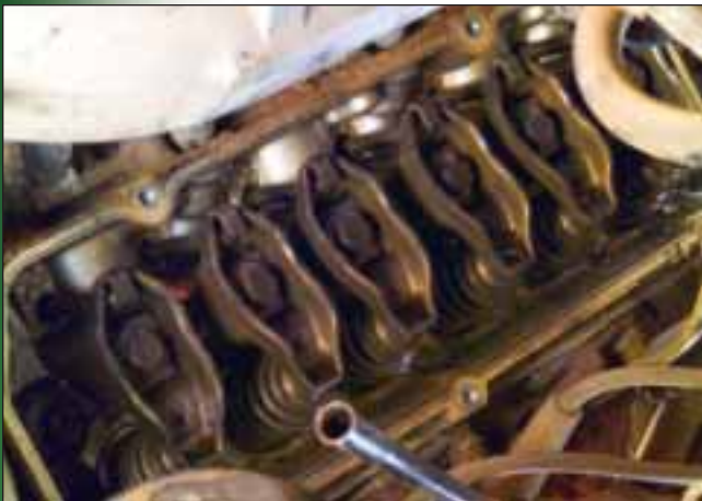
A wider view of the head and rockers. Very clean.