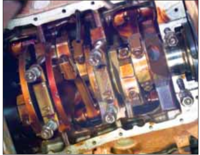
The lower crankcase area was very clean and free of any sludge deposits. The rear main bearing journal was removed showing no signs of visible wear on the crankshaft journal.