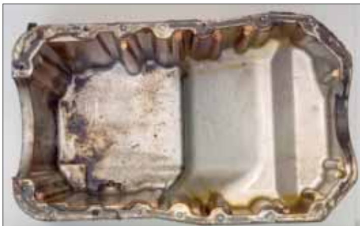
The inside of the engine oil pan was very clean. There were no sludge deposits found in the bottom of the pan.