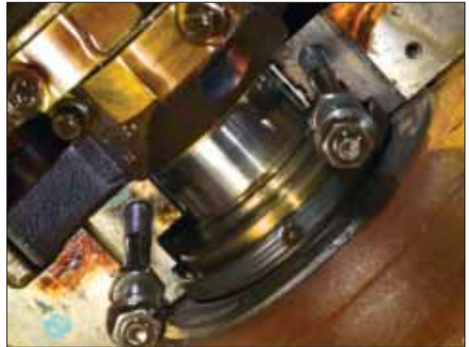
A closeup view of the rear main crankshaft journal. No visible wear detected.