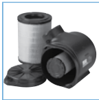
G150048 EPG Air Cleaner 15" Radial Seal