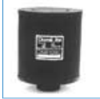
C105017 ECC DuraLite™ Air Cleaner 10.50"