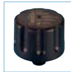
P564669 T.R.A.P.™ Hydraulic Reservoir Breather 1" NPT