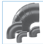
P107844 90° Rubber Elbow 5" I.D.