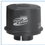
H002436 TopSpin™ Pre-Cleaner 7"