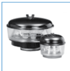
H001251 Pre-Cleaner Full view 7"