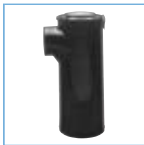
G112404 ECG Konepac™ Air Cleaner 11"