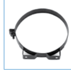
P007191 Air Cleaner Mounting Band 6.5" I.D.