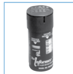
X002277 & X002278 Filter Service Indicator The Informer™ 20" & 25" Limit