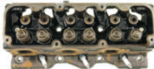
Cylinder head pre-cleanup. Note the sludge deposits on and around the valve springs and push rod openings.

NOTE: It is not recommended to flush transmissions that do not have a removable pan or access to the transmission filter.