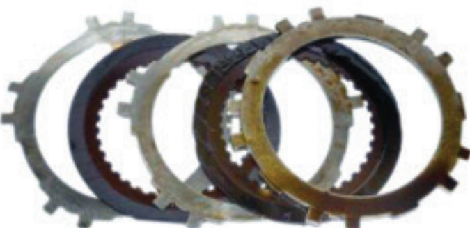
Automatic transmission clutch plates pre-cleanup. Varnish and glazing is heavy on some of the plates.