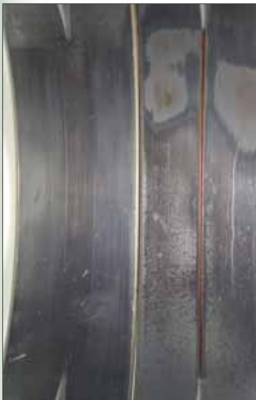
Engine main bearing halves show very little wear and are still suitable for continued use.

Each truck produces six quarts of waste-oil per oil change. With 60 vehicles being serviced every four months, that's 360 gallons per year. By switching to AMSOIL Guardian Pest Control prevents the disposal of 720 gallons of waste-oil every year. The environmental impact of this savings is enormous. It also frees up shop space that would be eaten up by drums of used oil.