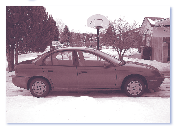
Matt Marshall's 1999 Saturn racked up 50,000 miles per year for five years, problem-free with AMSOIL motor oil.

Marshall saved money through the superior protection provided by AMSOIL synthetic motor oil and AMSOIL Ea Oil Filters, and Norman's mind was set at ease by AMSOIL