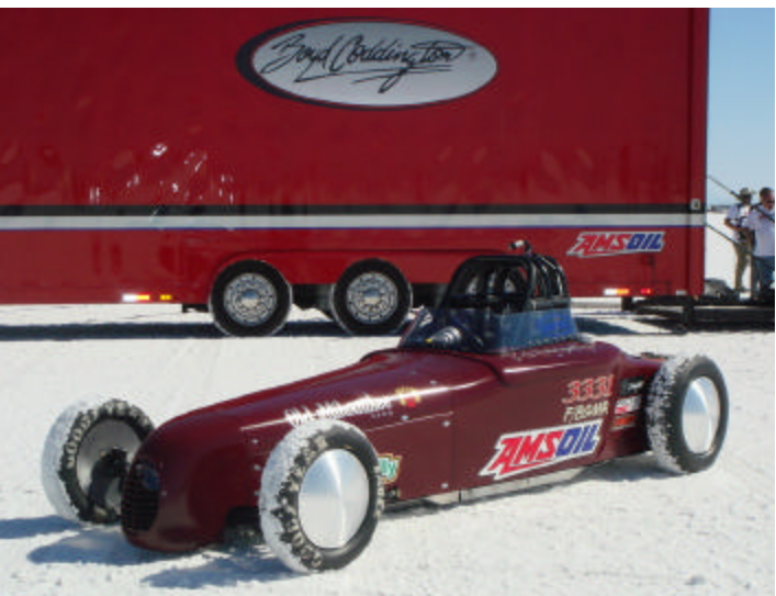
The AMSOIL logo was displayed prominently on the AMSOIL/Coddington roadster at Bonneville.