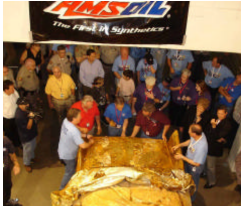
Not even AMSOIL synthetic lubricants could save the rusted out '57 Belvedere.