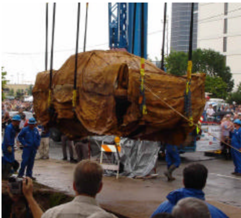
Workers carefully raise the 1957 Belvedere from its underground vault.