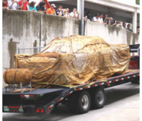
The Belvedere is transported to the Tulsa Convention Center for a public unveiling.