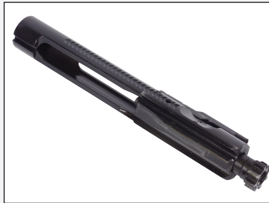
AMSOIL Synthetic Firearm Lubricant provided exceptional performance over rigorous range testing in multiple firearm applications.