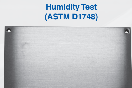
AMSOIL Firearm Cleaner (no corrosion)