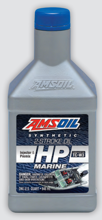
NMMA TC-W3 API TC

HP Marine is formulated with MAXDOSE™, a system of advanced additives for "super-clean" operation. It helps prevent deposits that lead to poor performance. In field testing, HP Marine inhibited ring deposits that can cause ring sticking and ring jacking (carbon build-up behind the ring, forcing it outward), a phenomenon that occurs in modern DFI outboard motors. It also virtually eliminated exhaust port deposits for reliable, efficient operation.