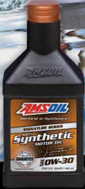
SYNTHETIC MOTOR OILS